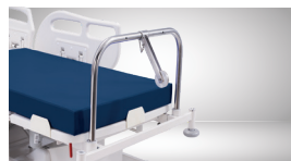
Orthopaedic Traction Pulley