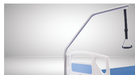
Stainless Steel Lifting Pole