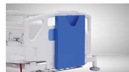
Moulded Chart Holder