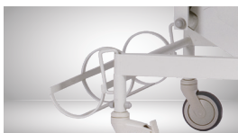
Oxygen Cylinder Cage