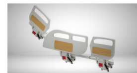
3rd Set of Safety Side Railings